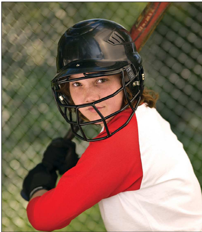
Wear protective eyewear while playing sports

If you normally wear eyeglasses, be sure that your frames are nonbreakable and fitted with safety polycarbonate lenses for playing tennis, baseball or basketball. Also make sure to wear the appropriate sports goggles.