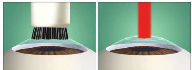
With PRK, a special brush may be used to remove the outermost layer of the cornea, the epithelium (left); a laser removes tissue from the cornea to reshape it (right).

PRK corrects your refractive error and eliminates or reduces the need for eyeglasses or contact lenses. Because no incisions are made, the procedure does not weaken the structure of the cornea.