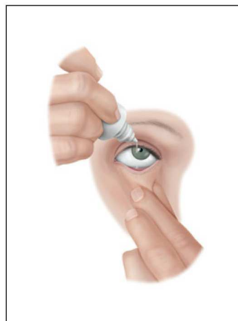
(B) pinching lid outward with thumb and index finger.