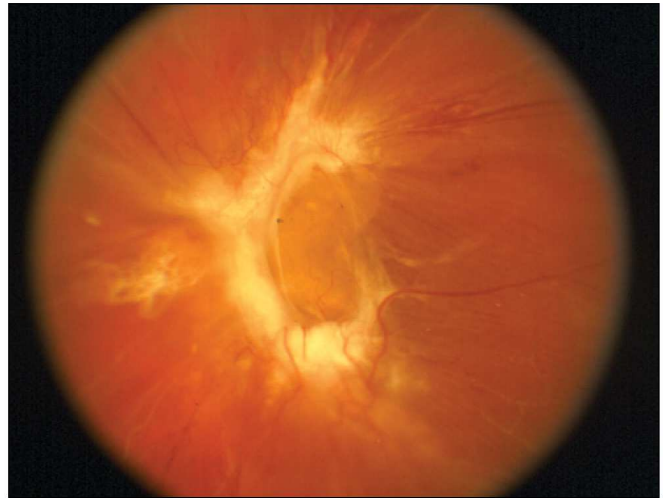
Traction retinal detachment

Vitreous hemorrhage alone does not cause permanent vision loss. When the blood clears, vision may return to its former level unless the macula is damaged.